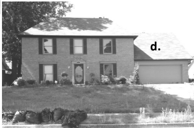
a., b. Dollar Tree stores on East Shelby Dr; c. Trash on Long Creek; d. Vacant house; e. Trash bins stored in front of home.